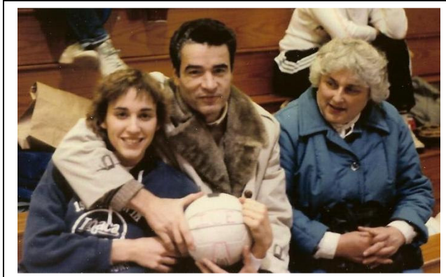
D'Apice family at USVBA tourney (Windsor, CT)