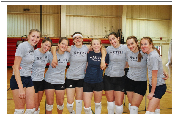
2005 Tournament Champion- Smith College

2004 "Break for Cathy": In 2004, 15 teams raised $7700