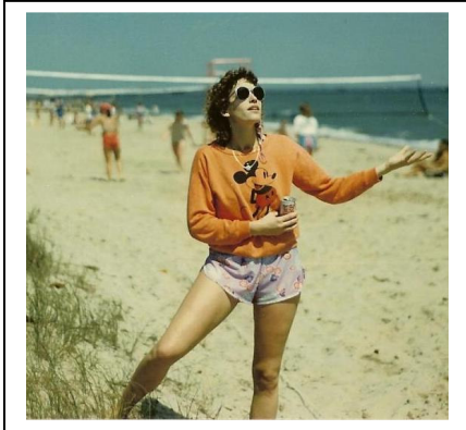
Sand doubles in Norfolk, VA